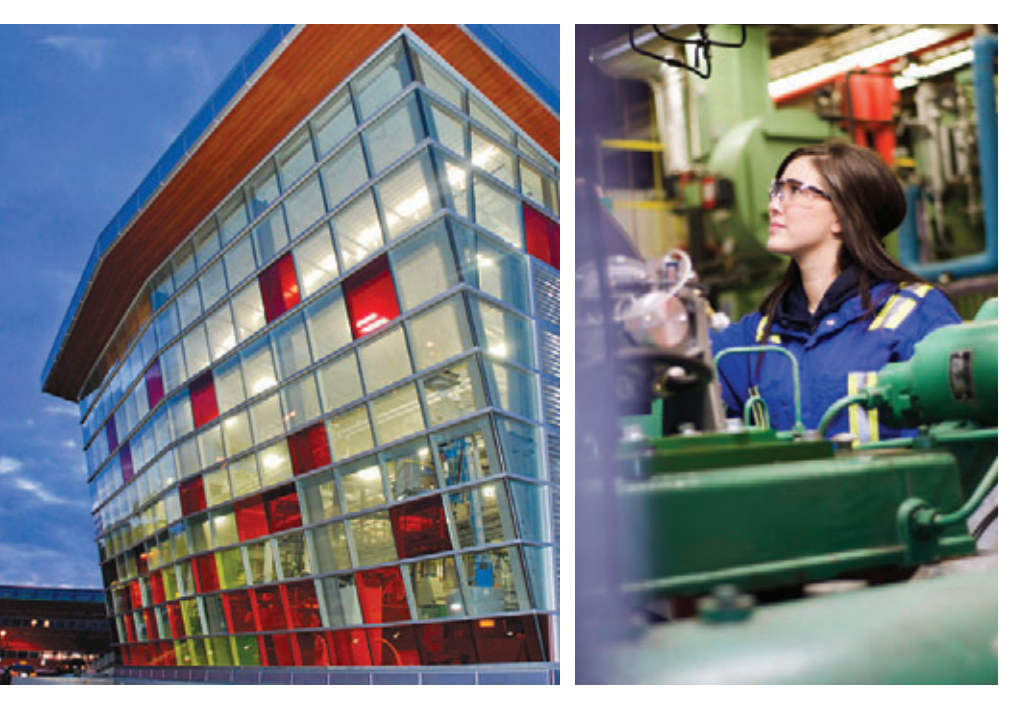
The state of the art Lakeland College Energy Centre is built with industry support including Husky Energy. Real equipment and Husky Energy support make real education happen.