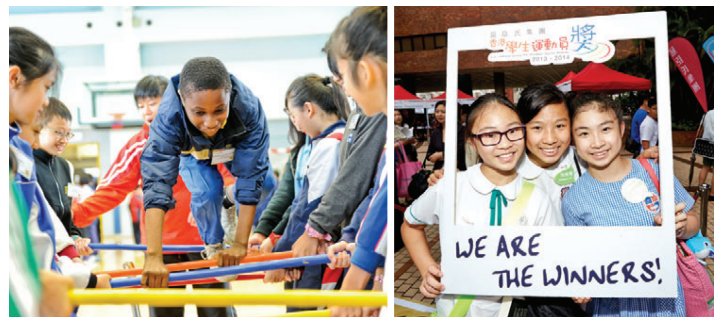
From left to right: Sporting spirit—at school, participation is encouraged. Winners: the best step to the next level. Athletes travel to Nanjing 2014 Youth Olympic Games to get into the sporting spirit.