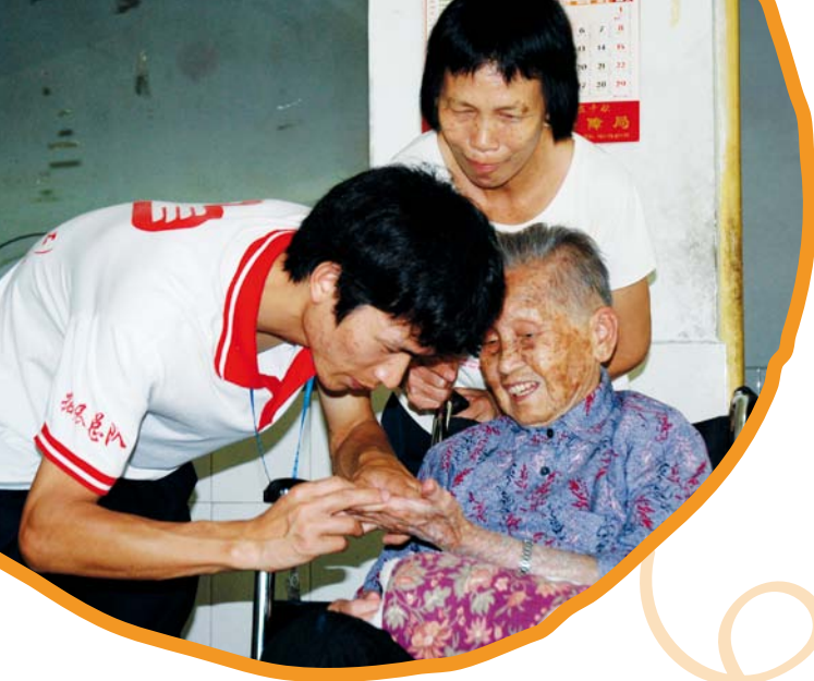
Staff from PARKnSHOP China bring health and wellness advice to the homes of elderly community members.