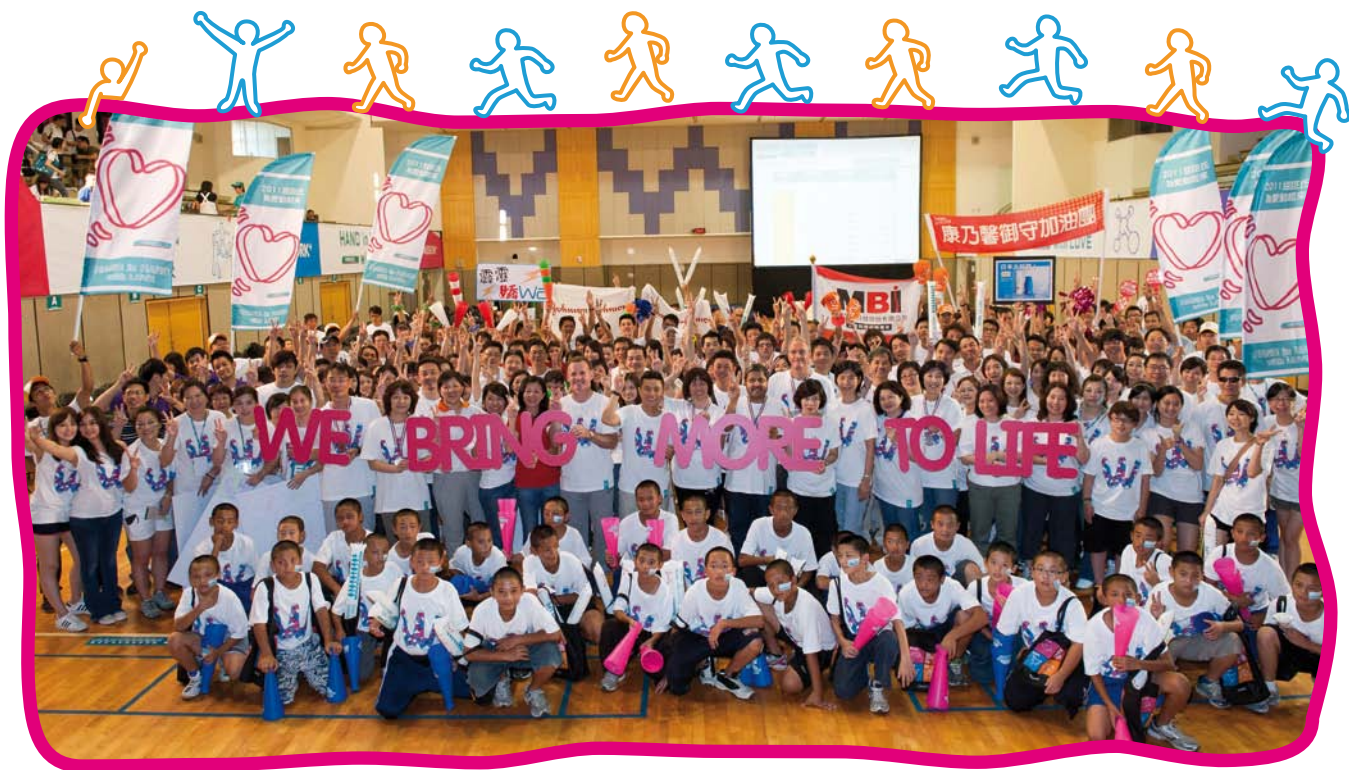
Together with students of the Hsin-chieh Elementary School in Taiwan, the staff, suppliers and families of Watsons Taiwan teamed up to raise money for underprivileged Taiwanese children through the Child Welfare League Foundation.

“This is a very important effort, because we have such a great responsibility to the local communities in which we operate .”